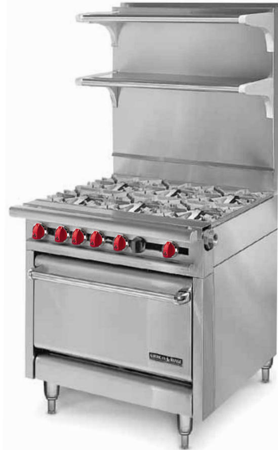
Model Shown HD34-6-1